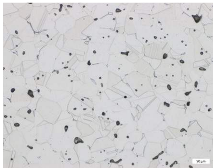
Predominately austenitic structures with rounded pores and minor fraction of delta-ferrite.