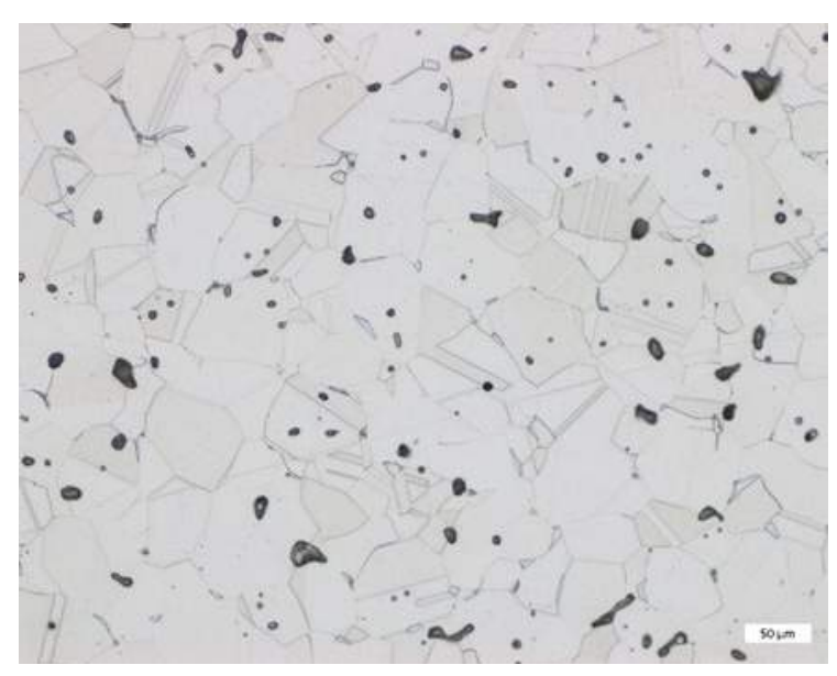
Predominately austenitic structures with rounded pores and minor fraction of delta-ferrite.