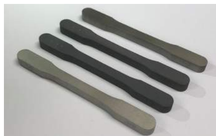
Specimens with subsequent process steps, bottom to top: as sintered, after hardening, after tempering and after blasting.